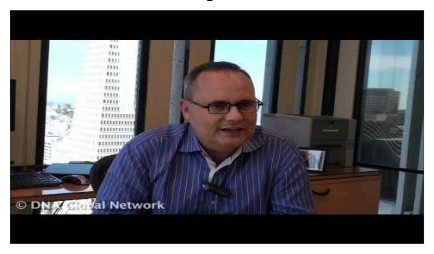
If play prompt does not appear, please click in the center of the slide.